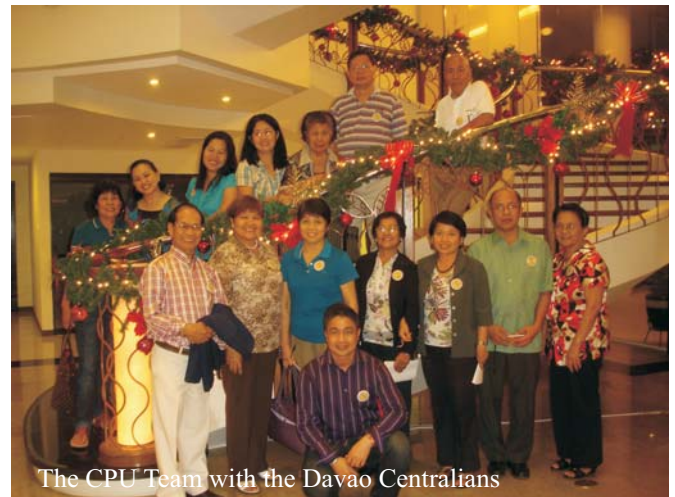
The CPU Team with the Davao Centralians