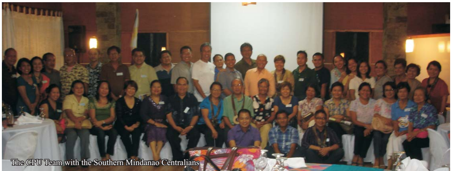
The CPU Team with the Southern Mindanao Centralians